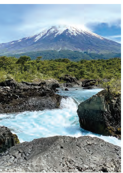
Among the items on exhibit at the Latin American Cultural Center are photographs capturing the beauty of Latin America, including this image of Vivente Perez Morales National Park in Chile, taken by photographer Bill DeWalt.

The second permanent exhibit hall is dedicated to Latin American art and the rich history of the region it reveals. Visitors will find examples of fine art, folk art, contemporary