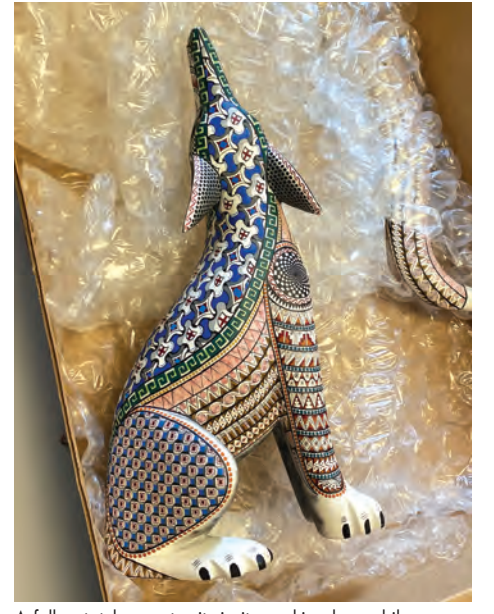
A folk art-style coyote sits in its packing box while museum displays are being constructed.

crafts, music, and film. Among the pieces on display are replicas of paintings by Frida Kahlo, traditional textiles, and a hands-on display featuring traditional instruments handcrafted by local artisans.