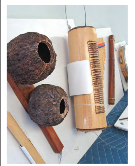
Traditional, hand-crafted, Latin American instruments are mounted and ready to be put on exhibit at the new cultural center.